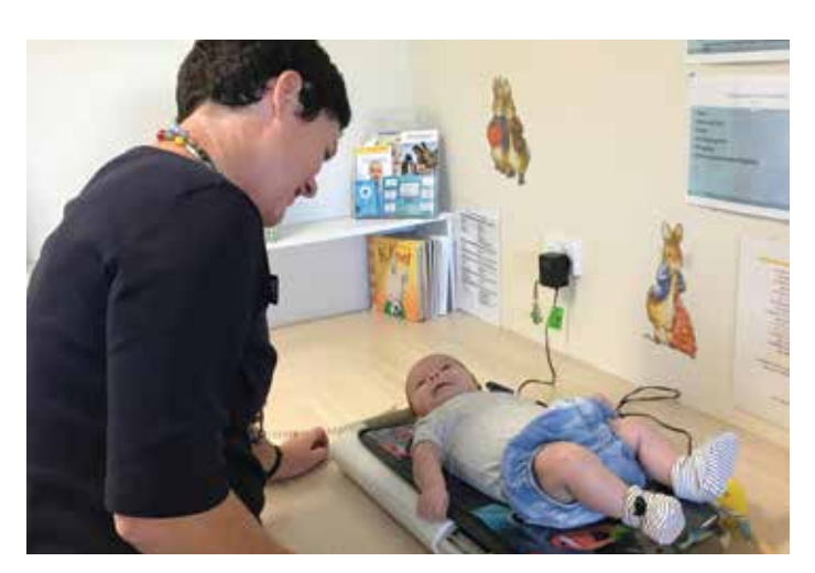
Maternal and Child Health Service Coordinator.

The KASV program is a schedule of 10 appointments for Golden Plains Shire children, from their first new born home visit through to their 3.5 year check-up.