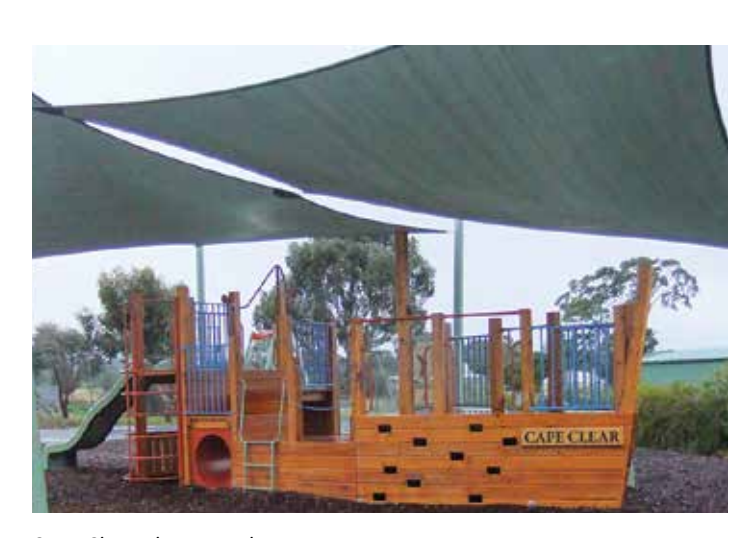
Cape Clear Playground.

Visit goldenplains.vic.gov.au/consultations to get involved and have your say.