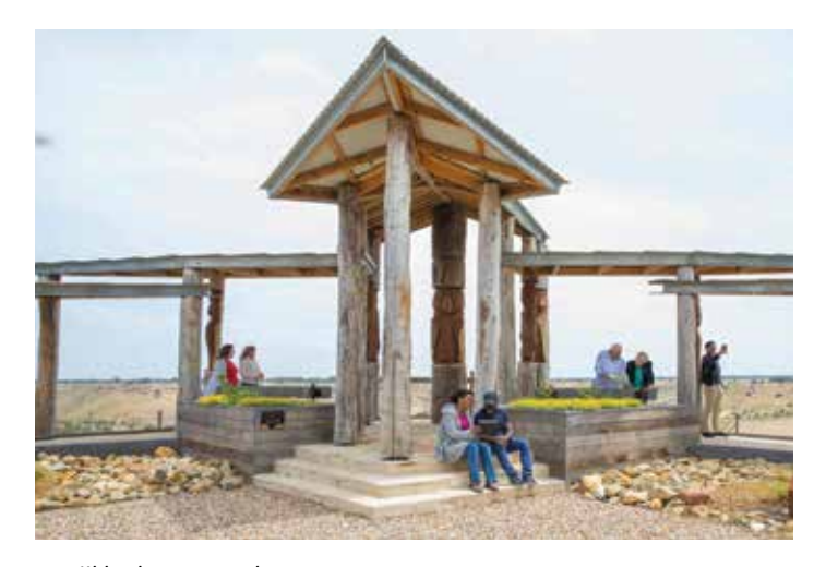
Bunjil lookout, Maude.