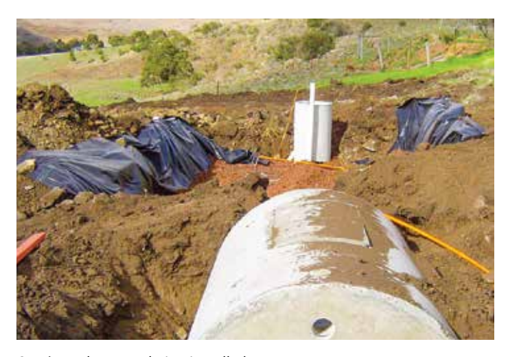
Septic Tank system being installed.

Further information including Council's Septic Tank Brochure can be accessed on Council's website under 'Septic Systems'.