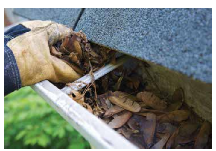
Cleaning gutters as a fire prevention.

Visit Council's website for a comprehensive section on fire and fire preparedness.