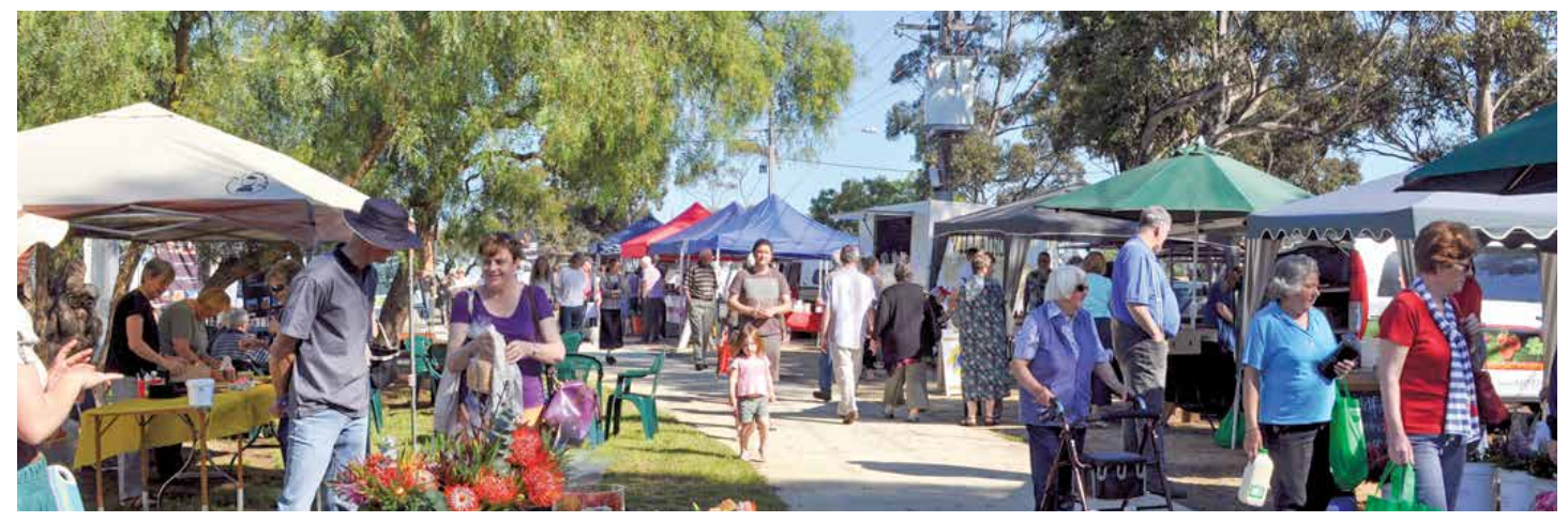
len Plains Farmers' Market. Bannockburn.