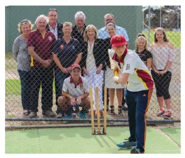
Cricket nets at the Bannockburn Recreation Reserve.

Our Shire has over 120 sport and recreation clubs and community groups, and over 140 recreation and community facilities; including playgrounds, halls and community centres, tennis facilities, sporting ovals and pavilions, skate and bike parks, golf clubs, lawn bowling facilities and equestrian centres. Check out the 'What's Near You' link on Council's website to find facilities close to you.