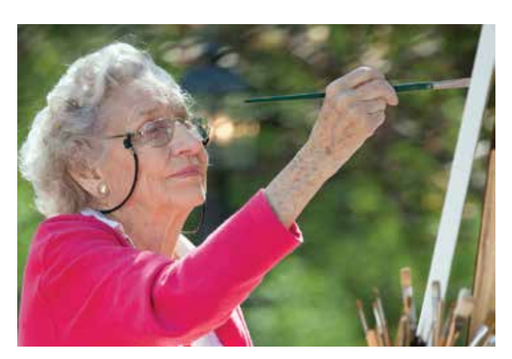
Enjoying the hobby of painting.

Contact the Aged and Disability team on 5220 7111 or the 'My Family' section of Council's website.