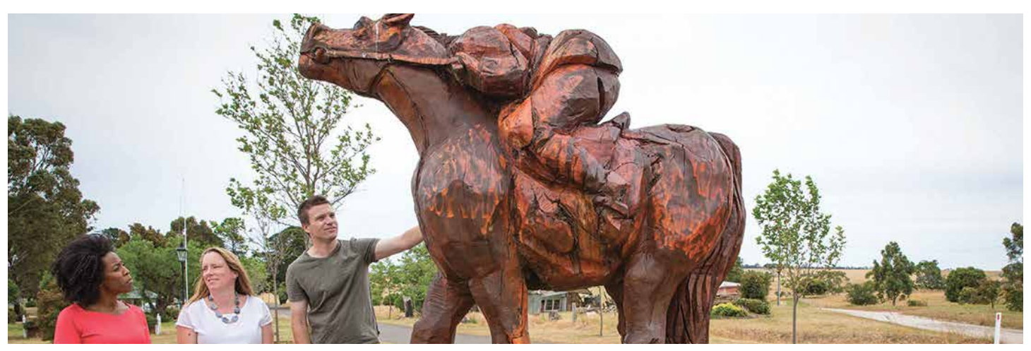
Corindhap Avenue of Honour, Corindhap.