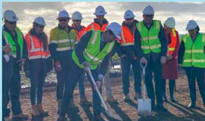
Mayor Cr Owen Sharkey at Berrybank Wind Farm with Premier Andrews and Minister D'Ambrosio

In addition to the environmental advantages of wind power, local residents will see great value from our newest neighbour, with GPG contributing significant funds for shared benefit activities in Golden Plains Shire. This funding will deliver more community grants for local organisations; an asset initiative for community projects, such as the Teesdale Turtle Bend Park upgrade and the