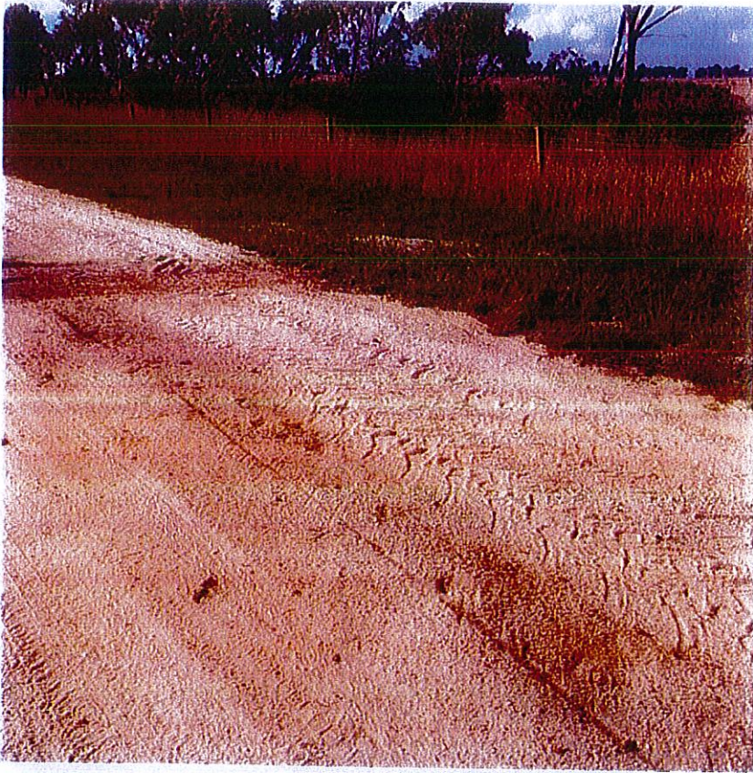
Longa Rd Inverleigh Needs attention now