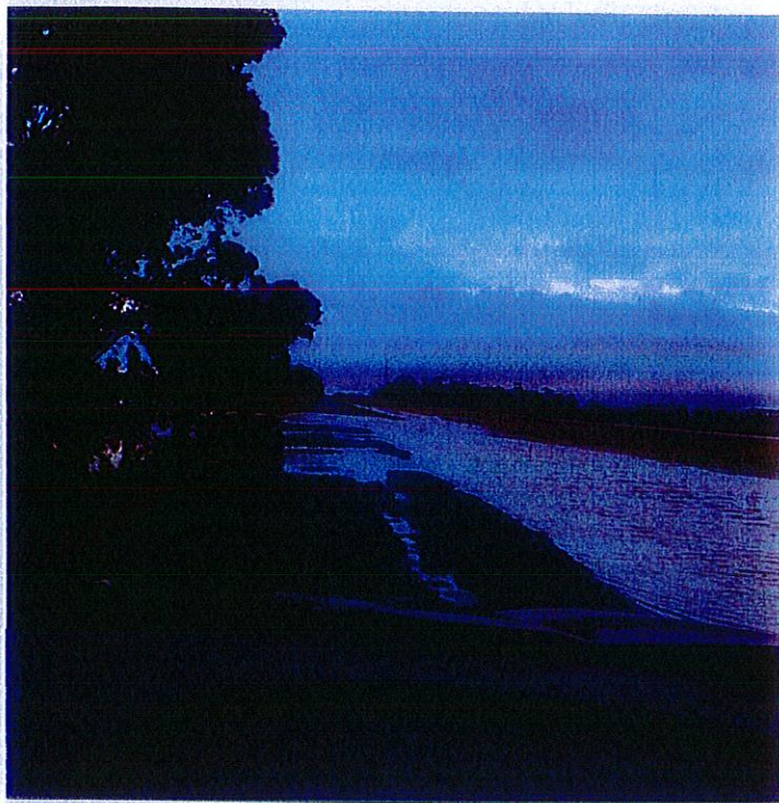
Cressy Shelford Rd

Cressy Shelford Road Anzac Day 2017 about 11am prior to this the water had been about 12 inches deep across the road traffic hazard needs culvert attention and possibly additional culvert