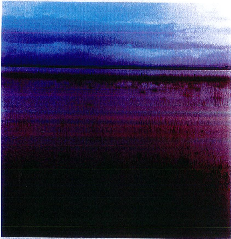
Longas Rd Inverleigh water runs on the road no drainage