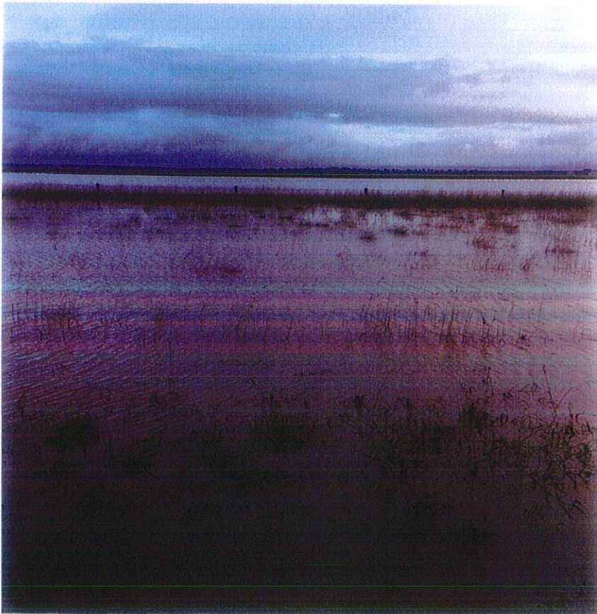
Longas Rd Inverleigh water runs on the road no drainage