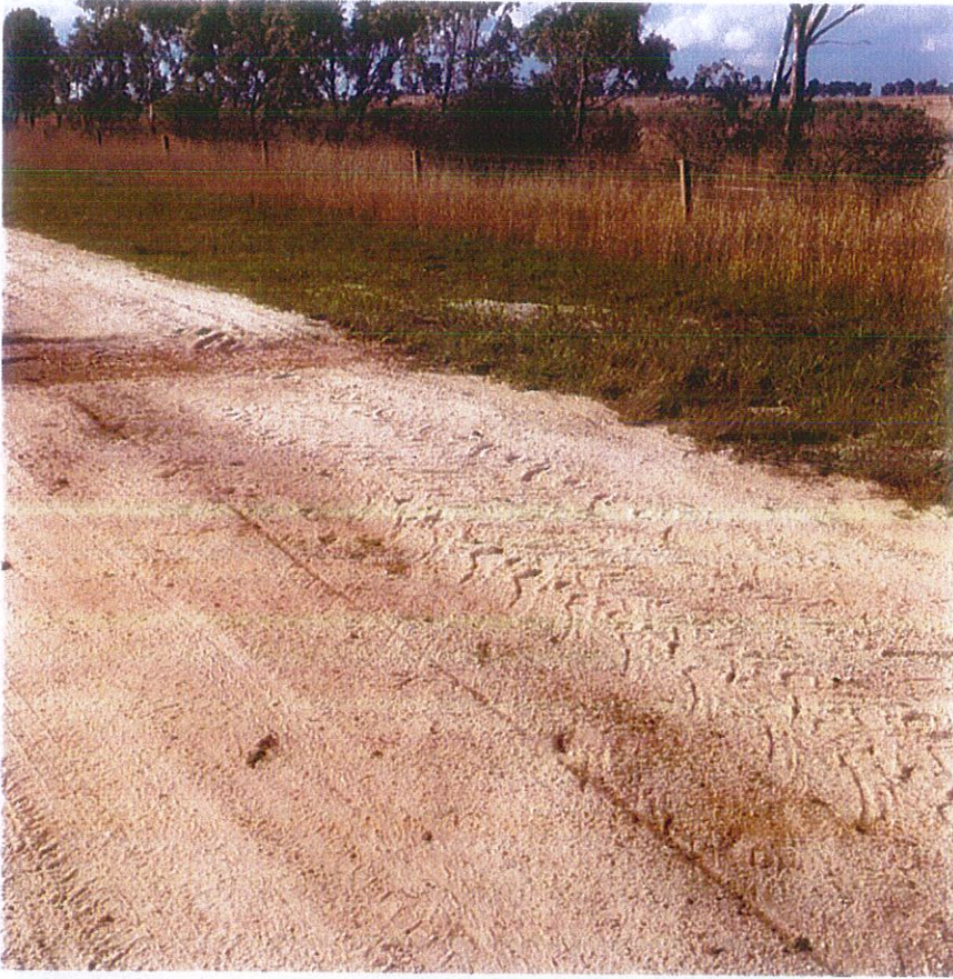
Longa Rd Inverleigh Needs attention now