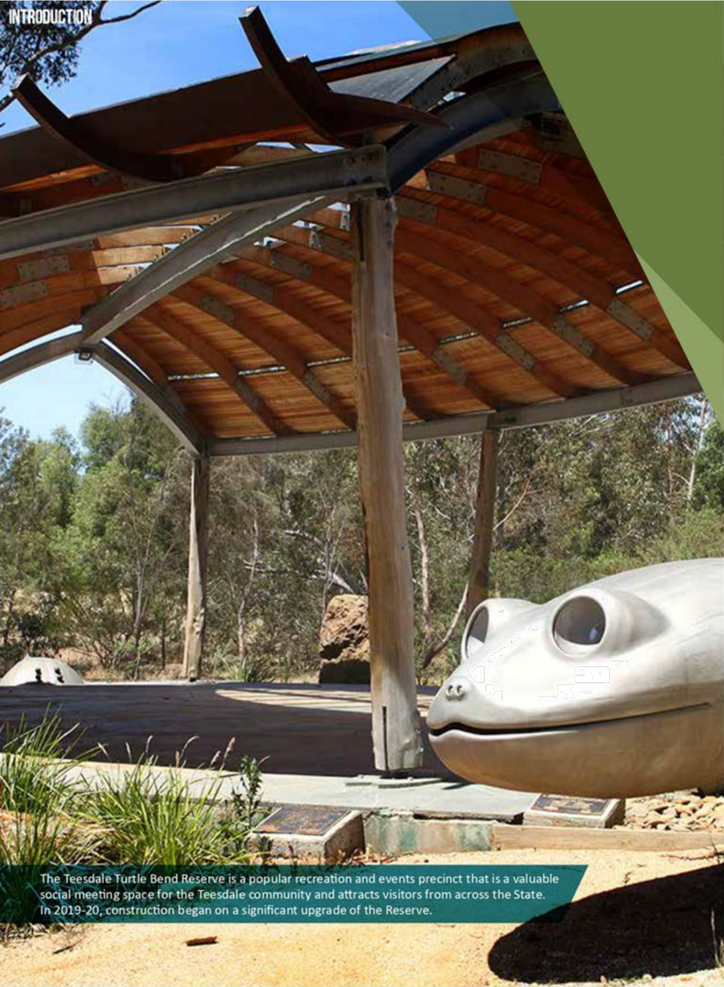
The Teesdale Turtle Bend Reserve is a popular recreation and events precinct that is a valuable social meeting space for the Teesdale community and attracts visitors from across the State. In 2019-20, construction began on a significant upgrade of the Reserve.