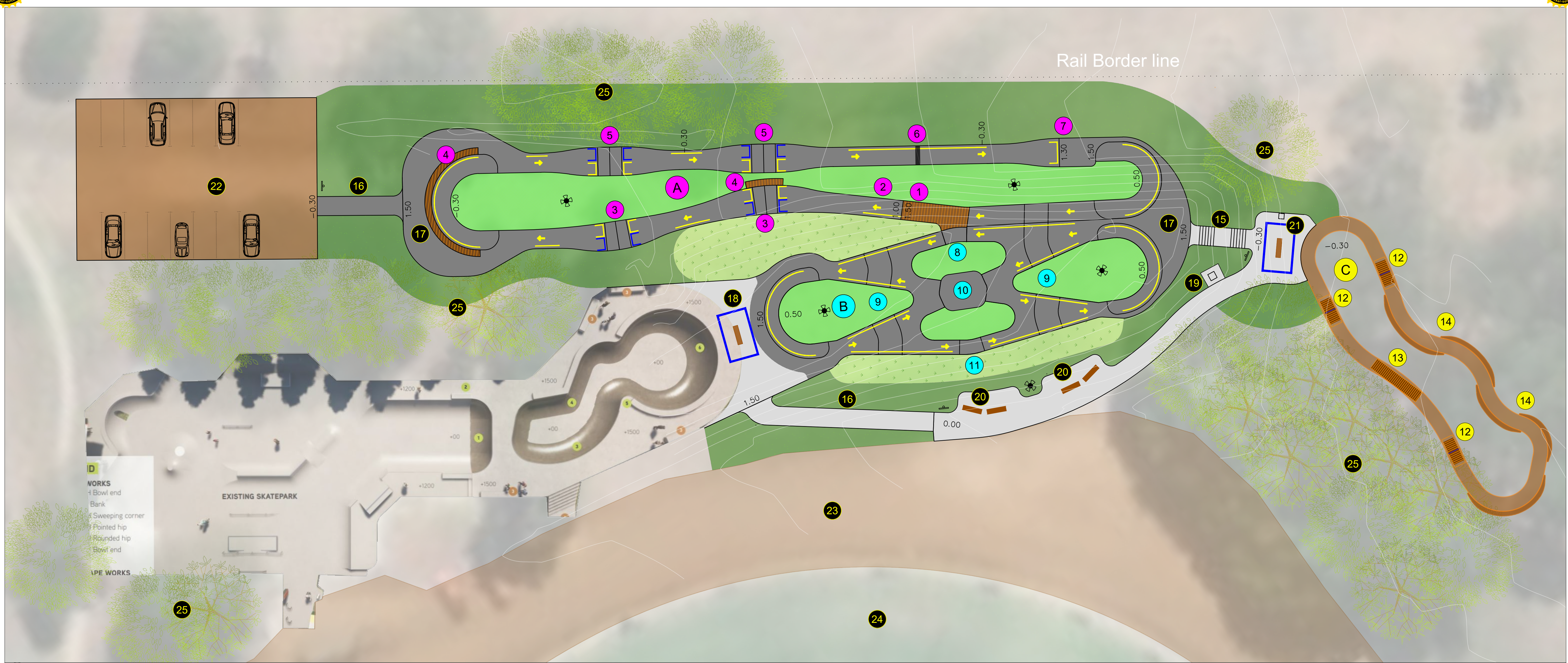
1 Pumptrack Plan A Scale 1:200