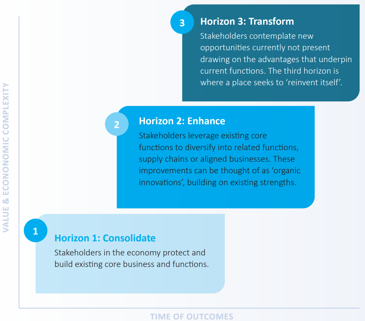
FIGURE 2 Three horizons economic transformation framework

It is essential to be active across all three horizons simultaneously while recognising that the scale and timing of benefits will vary. An exclusive focus on consolidation projects will quickly disappoint many stakeholders as not being visionary enough. Equally, a strategy with its 'head in the clouds' can also be expected to rapidly lose support and momentum. Applying the Three Horizons framework to the Golden Plains Shire economy provides structure to the continual process of evolution towards transformative change. The timeline is not necessarily a starting date but instead an outlook of when success can be achieved.