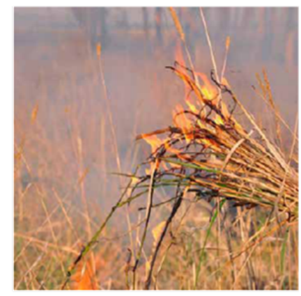
Wiyn-murrup yangarramela — Fire Spirit Comes Back.