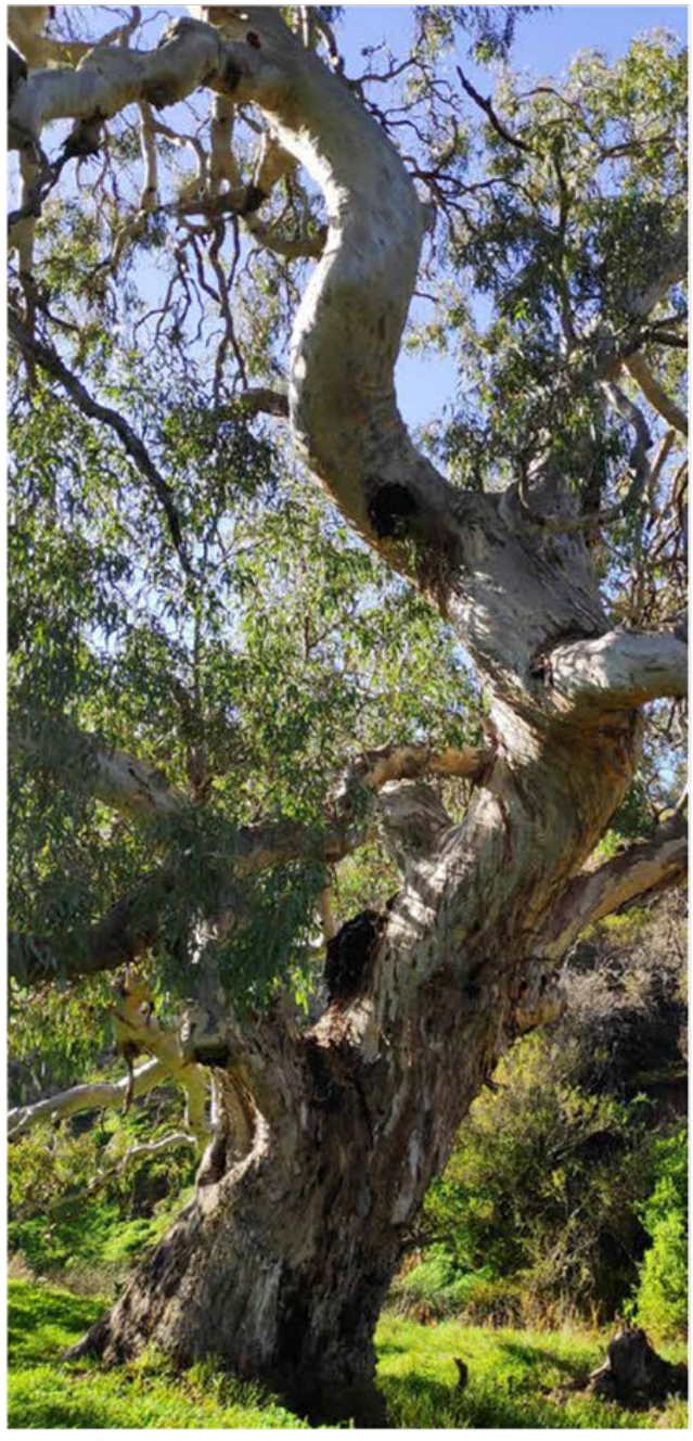
River Red Gum