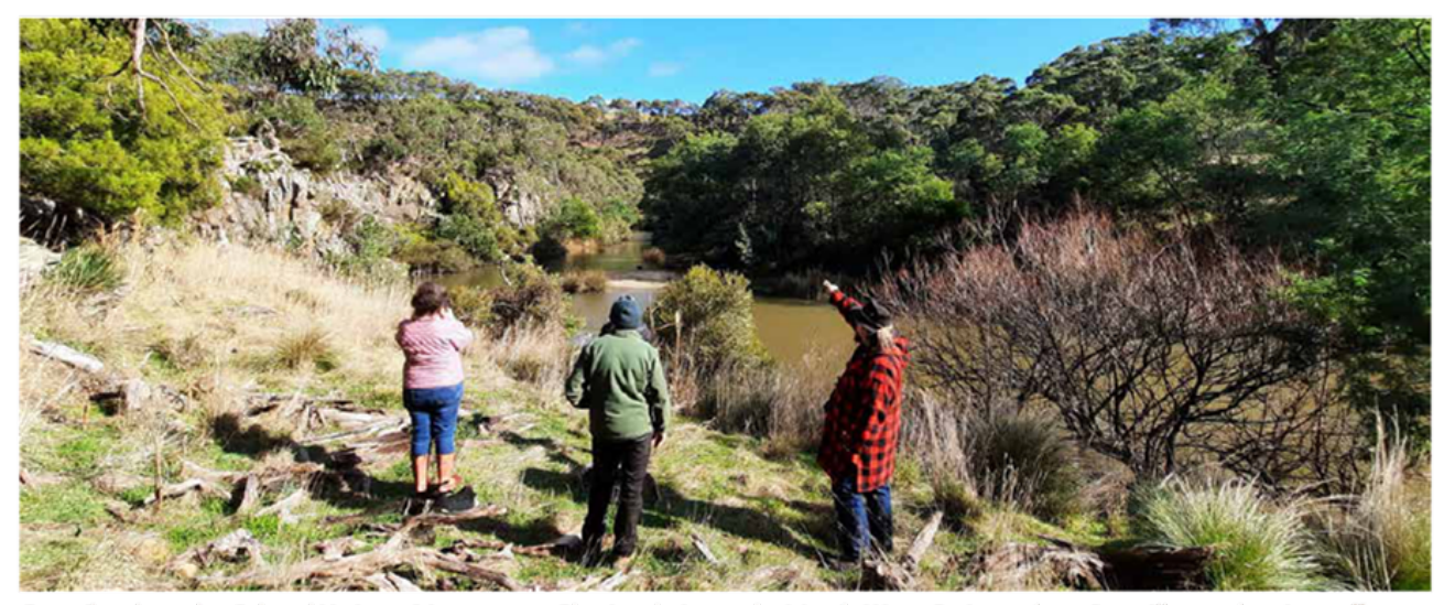
Council undertook a Cultural Heritage Management Plan in relation to the Maude Water Project, where Councillors and senior staff participated in an induction and Walk on Country to increase their knowledge and appreciation of Aboriginal Cultural Heritage.

This is the beginning of the journey for Golden Plains Shire Council which focuses on building relationships and Acknowledging the Wadawurrung and Eastern Maar as the Traditional Owners and Custodians of this land.