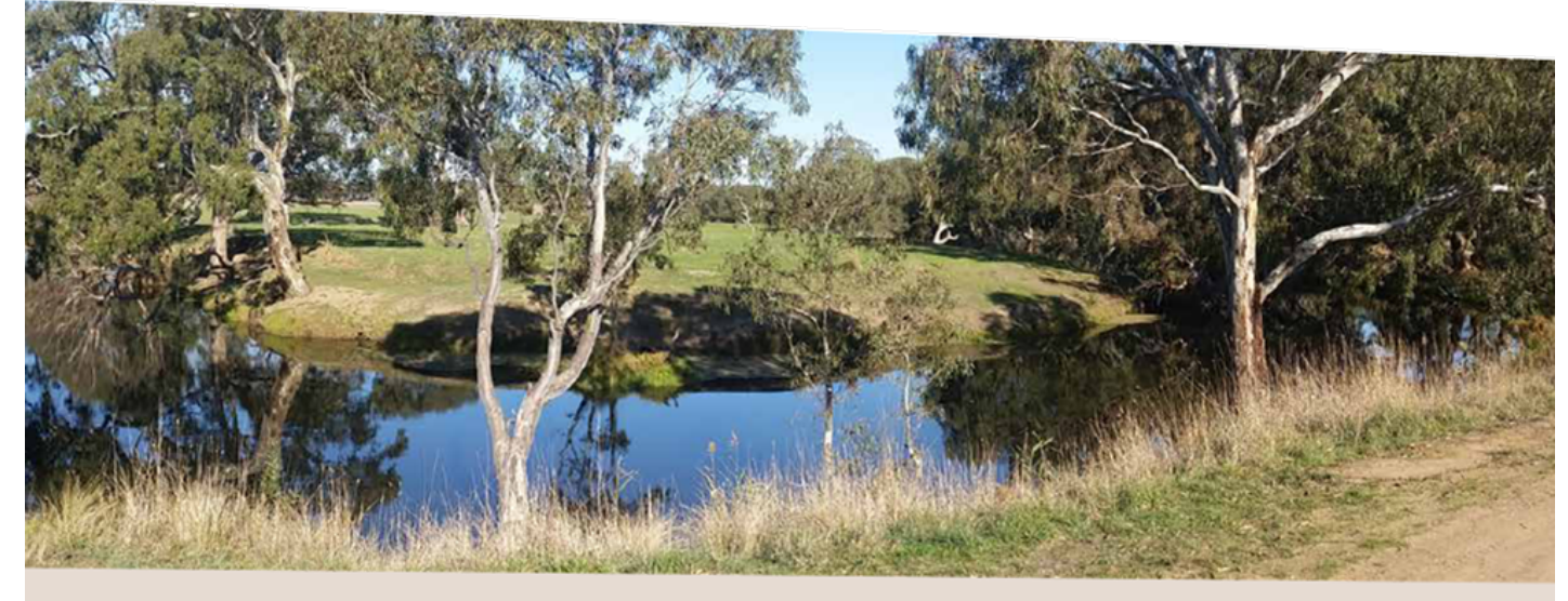
GOLDEN PLAINS SHIRE COUNCIL REFLECT Reconciliation Action Plan June 2022 – December 2023