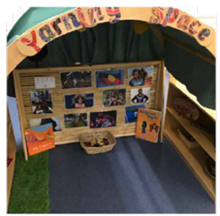
Yarning Space - NAIDOC Week Inverleigh Kindergarten