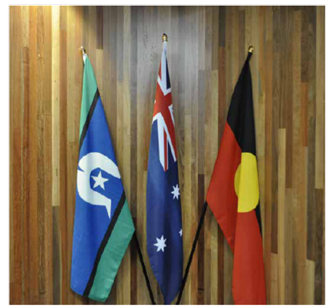
Golden Plains Shire Council Chambers, proudly displays the Aboriginal flag and Torres Strait Islander flags alongside the Australian flag.

GOLDEN PLAINS SHIRE COUNCIL REFLECT Reconciliation Action Plan June 2022 – December 2023