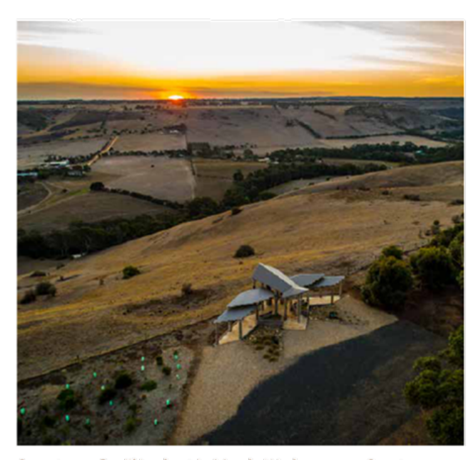
Sunset over Bunjil Lookout in Maude, Wadawurrung Country

We believe that all residents should have the opportunity to develop to their full potential and strive to create a place in safe, sustainable and supportive communities.