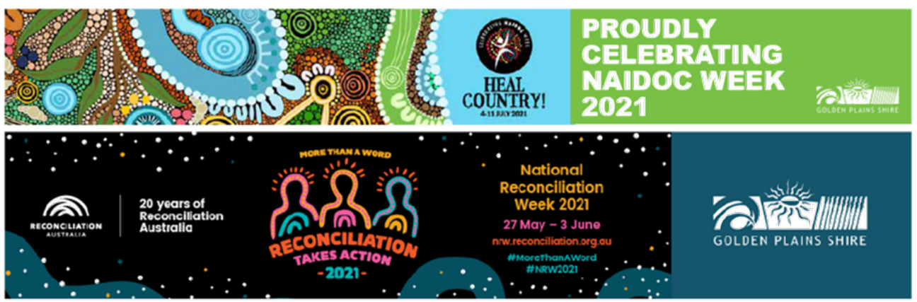
Council participates in NAIDOC week and Reconciliation Week displaying Council's commitment on our social channels, website and email. These are some banners from 2021.