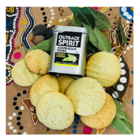
Biscuit baking with traditional flavours -NAIDOC Week Inverleigh Kindergarten